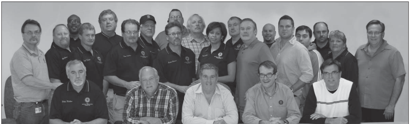
Your UAW GM National Negotiating Committee that negotiated the new 4-year proposed agreement.

At the start of these negotiations, the corporation sought to end or limit our input in a number of areas, including Quality Network Planned Maintenance and our input into the Maximo system. Your negotiators rejected this attempt to reduce our input and instead won language that commits the company to a joint study on increasing QNPM's value to the plants. Topics in this study will include but will not be limited to Capacity Assurance Coordinators, Predictive Maintenance Technologies, Maximo and continuous improvement of QNPM to support world-class manufacturing.