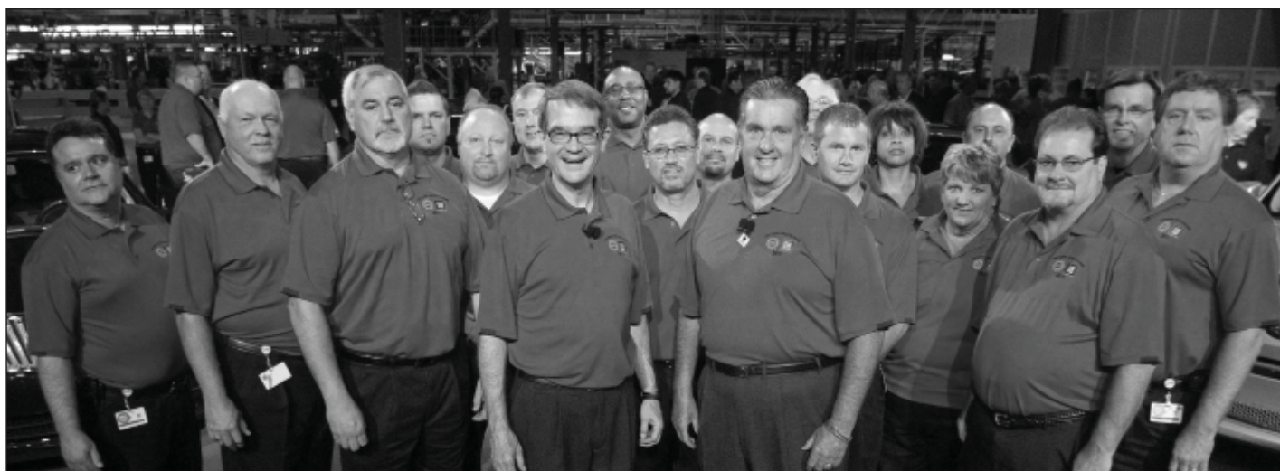
The UAW GM National Negotiating Committee, above, opened bargaining July 27 at the company's Detroit-Hamtramck facility.

The Personal Savings Plan (PSP) has provided the means for many of our members to save for their retirement. These savings have been an important addition to the monthly benefits our retirees receive. The bargaining committee negotiated significant improvements to the PSP.